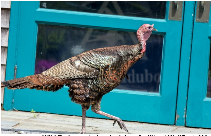
Wild Turkey entering Audubon facility at Wellfleet, MA