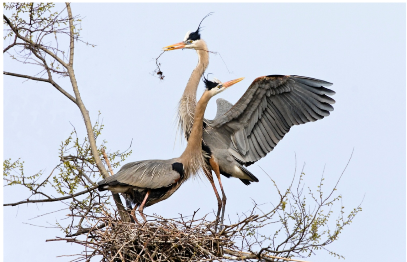
Courting Great Blue Herons, Richmond Heron Rookery