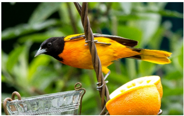
Baltimore Oriole, Wellfleet Bay Wildlife Sanctuary, MA

(if you don't subscribe the archives are at <a href="https://www.freelists.org/archive/va-richmond-general/">www.freelists.org/archive/va-richmond-general/</a>) or the RAS website for any late breaking news about field trips (<a href="https://www.richmondaudubon.org/">www.richmondaudubon.org/</a> ActivFieldTrip.html.)