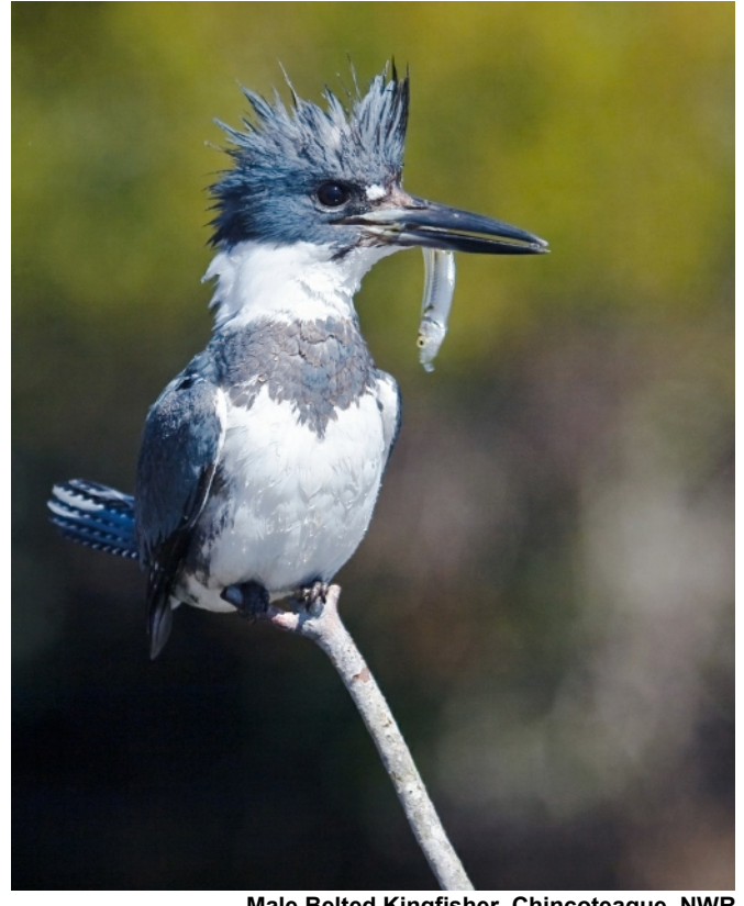
Male Belted Kingfisher, Chincoteague NWR

In our continuing series of birds that are often heard but seldom seen, the Ovenbird gets the limelight in this issue.