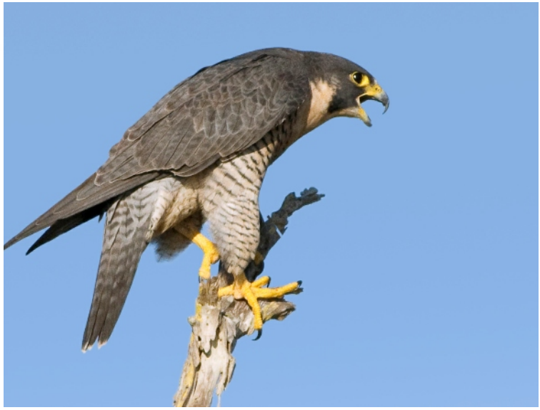
Peregrine Falcon, Blue Cypress Lake, FL